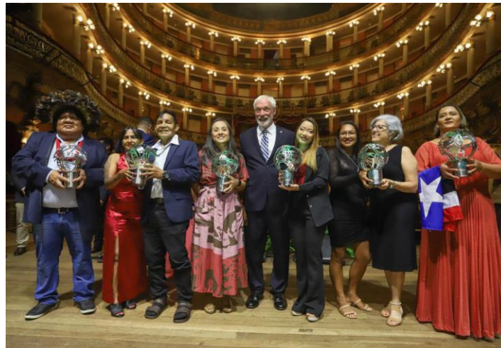
The United Earth Award – Winning projects